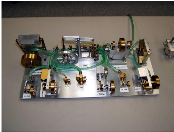
Tony's Miniature Steam Engines